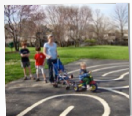
WALK THE LABYRINTH