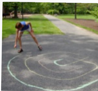
CREATE OUTSIDE LABYRINTH